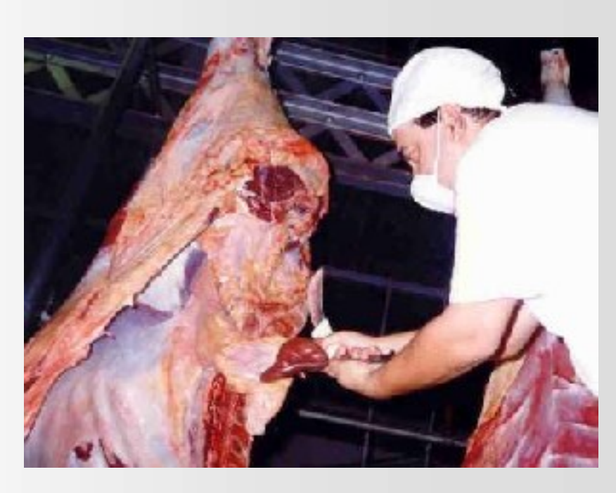
Meat Processing Plants (Slaughterhouses)