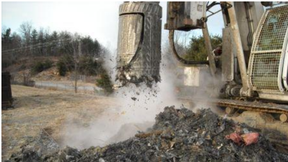
Figure 3-5. Vertical Extraction Well Drilling

Vertical LFG wells typically have a diameter of 20 to 90 cm to easily lift waste materials out and achieve good LFG extraction. A bucket-type auger drill rig is the most desirable type for drilling in solid waste. This type of drill rig uses a large hinged cylindrical bucket with cutting blades at the base to cut through materials. However, this type of drill rig is not commonly available in many countries, and a standard auger also may be used. In addition, some drillers have limited or no experience with solid waste and may not want to use the more expensive bucket-type auger rig in such applications for fear the rigs will be damaged. Figure 3-5 shows a vertical extraction well being drilled with a bucket type auger.