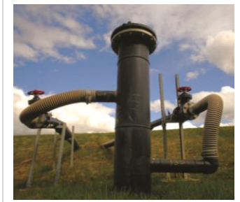
Figure 3-3. Wellhead

Wellheads are typically found on the extraction wells above the surface to allow for vacuum adjustment and sampling of the LFG. There are several components of a LFG wellhead: a vacuum control valve; monitoring ports; and an option for flow measurement. The vacuum control valve allows an LFG technician to adjust the vacuum applied at each individual wellhead. The wellhead is often designed with one or two monitoring ports so an LFG technician can measure the temperature, pressure, and composition of the LFG. These ports allow an LFG technician to record the impacts of well adjustments and to identify potential problems and troubleshoot errors that may occur in the GCCS. Frequent wellhead monitoring promotes optimal system operation and allows for effective system maintenance. In addition, wellheads can include a flow measurement device (for example, an orifice plate or pitot tube) to measure the differential pressure of the LFG and use those figures to calculate the LFG flow. The top of the wellhead should include a removable cap to access the well for internal inspection and measure and remove liquids as necessary. High levels of liquid (leachate) in a well can reduce LFG collection, especially if the liquid level is above the perforated pipe section of the well, preventing the gas from moving into the well.