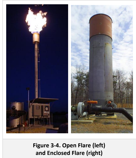
Figure 3-4. Open Flare (left) and Enclosed Flare (right)

The type and rated capacity of the blower and flare system are determined by anticipated LFG collection rates (see Chapter 6) and the overall goals of the LFG project. SWD sites that are currently accepting waste should anticipate installing a blower and flare system that can process the increased amount of LFG that will be collected as more waste is deposited at the site. Flares are used for all LFG projects, often in combination with an energy utilization project. These flares may run continuously in the case when projects have collected gas quantities in excess of the energy utilization needs or intermittently when used primarily during plant startup or downtime.