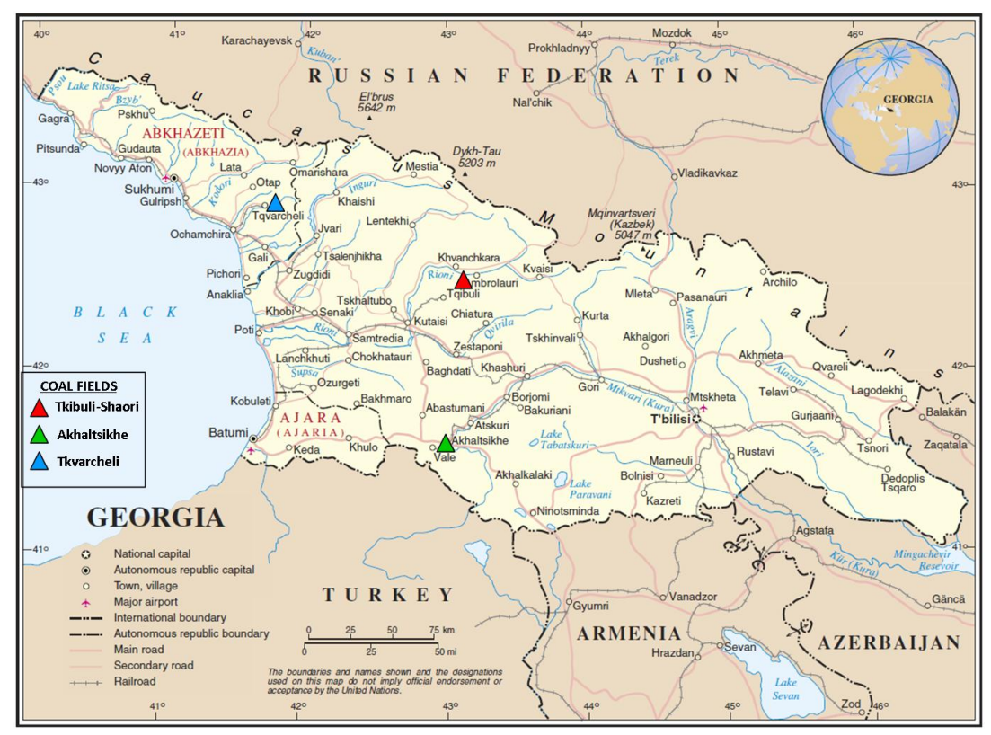
Figure 13-1. Georgia's Main Coal Fields

Coal deposits were discovered in Georgia in the first half of the 19th century, although until the 1930s geological exploration of these deposits was sporadic. Rapid development of the coal deposits in Georgia began after World War II, with produced coal being supplied to the Rustavi iron and steel works. Seven coal deposits have been discovered in Georgia, but only three of them are of commercial importance: the Tkibuli-Shaori and Tkvarcheli bituminous coal deposits and the Akhaltsikhe brown coal deposit (Figure 13-1). Most of the republic's coal reserves are concentrated in these deposits and the Tkibuli-Shaori deposit accounts for more than 75 percent of Georgia's coal reserves, followed by Akhaltsikhe and then Tkvarcheli (UNFCCC, 2009).