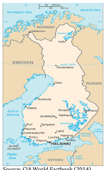
Figure 11-1. Location of Finland's Coal Reserves