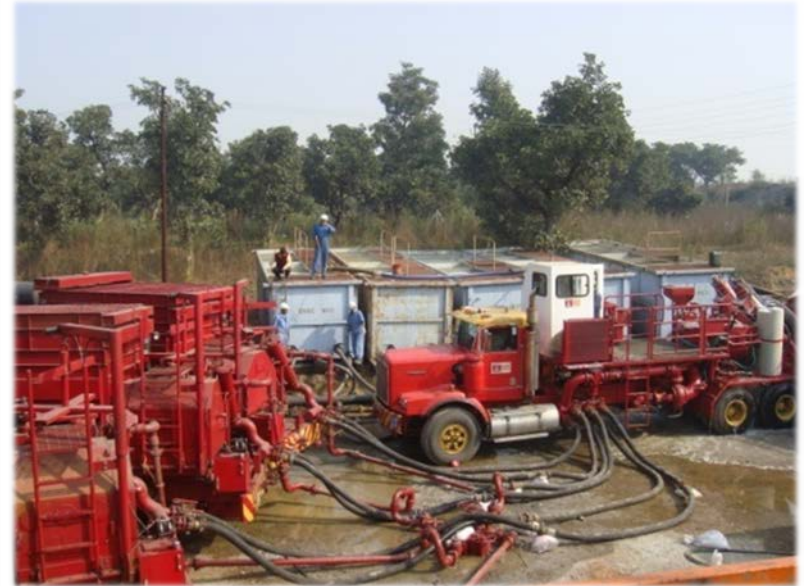
Hydro-fracturing unit at CBM Well