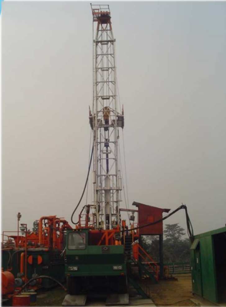
CBM Rig unit in operation