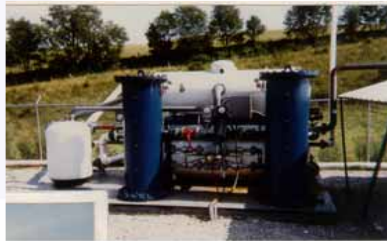
Coal Mines 煤炭