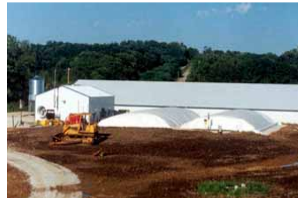
Agricultural Waste 农业废物