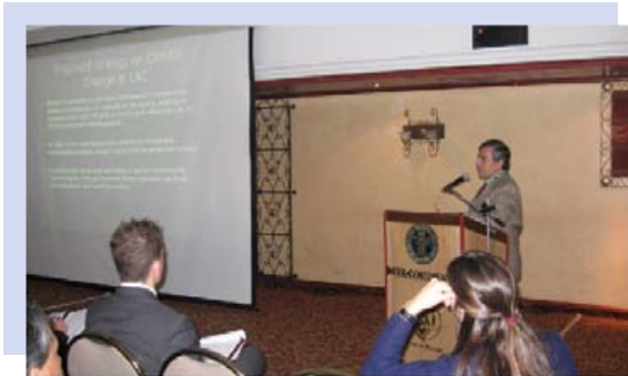
Walter Vergara, World Bank