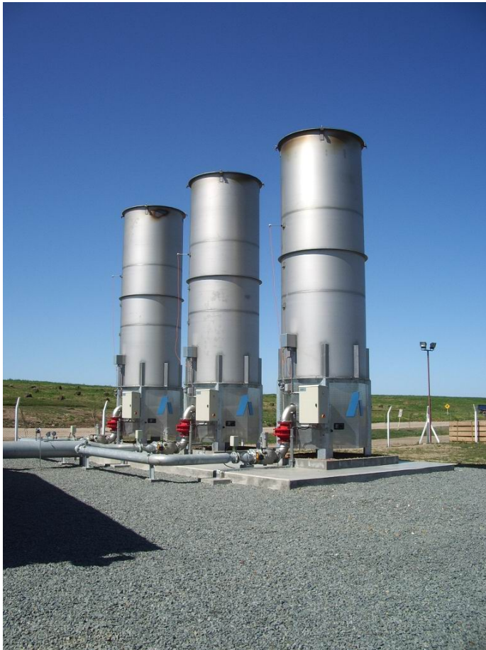
Enclosed Landfill Gas Flares to burn the gas