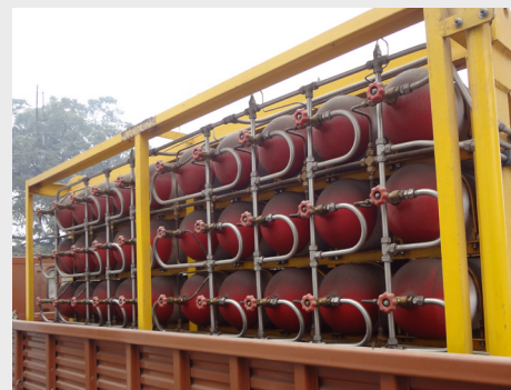
Cylinders for biogas